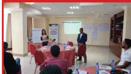
ECES Media Monitoring Training for the NEBE MMU