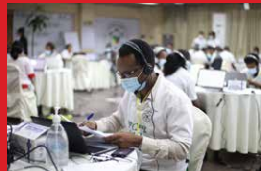
CECOE Election Situation Room