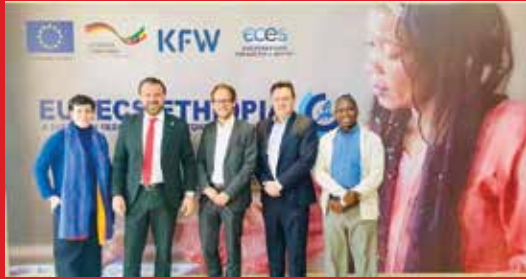
Donor - Implementing Partners Group Pictures

ECES activities in Ethiopia, composed of the four interventions related to the overall context of the general elections 2020; are funded by the following: