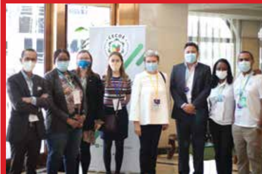
E-DAY at CEEOE Situation Room, Golden Tulip, Addis Ababa