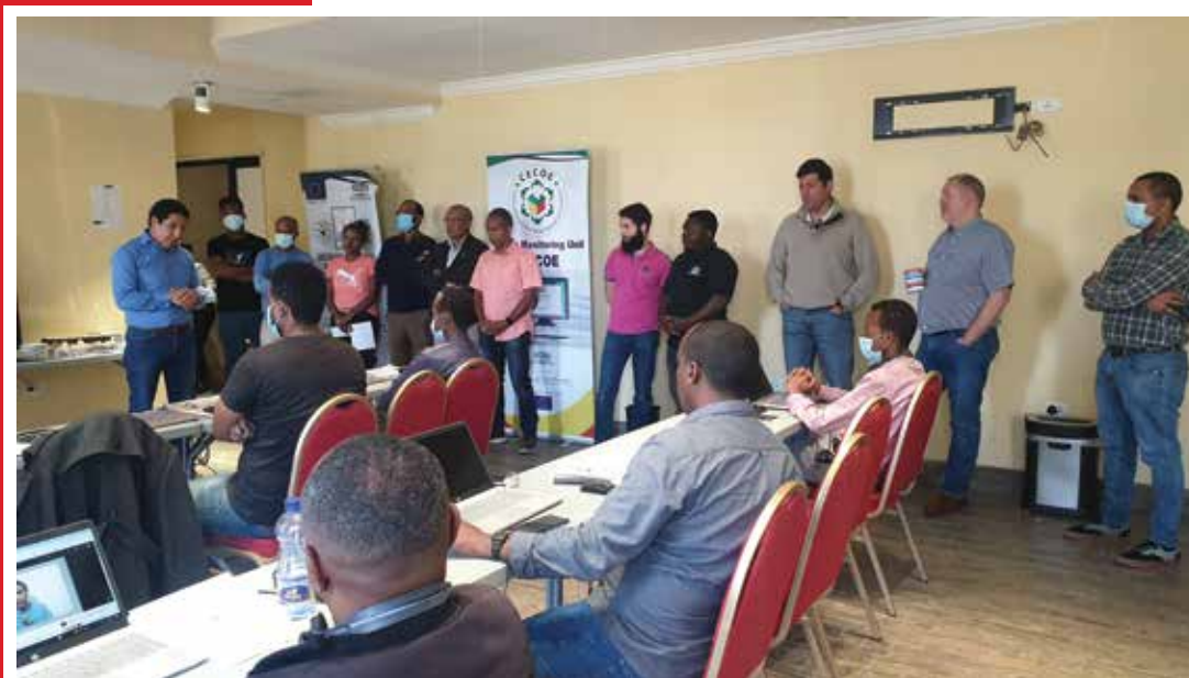
CECOE Media Monitoring Unit located in ECES office, Addis Ababa

Furthermore, reports were released on a variety of topics, including political party debates throughout the campaign, media coverage of NEBE's operations and political parties' social media activity. These reports have been useful in monitoring the electoral process, and CECOE has used them as input for its role in election observation and the establishment of the Election Situation Room .