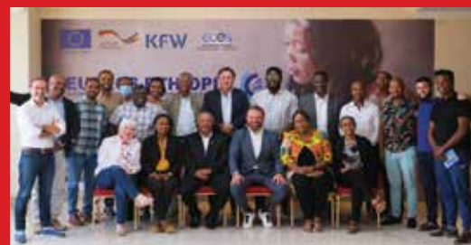
ECES Ethiopia Team group picture

Project activities are implemented in close collaboration with the National Electoral Board of Ethiopia - NEBE and the Coalition of Ethiopian Civil Society Organizations for Elections - CECOIE.