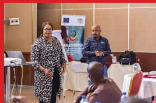
ECES Gender & Inclusion Expert facilitating training