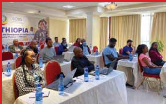
Finance & Admin SOP Training, Addis Ababa

PME-Conseils contributes to the successful financial and accounting management of projects by providing the necessary specialized assistance and guidance, as well as financial and cost accounting specifically tailored to project supervision. PME-Conseils also ensures that the budgetary and financial reports prepared as part of the project are in line with donor requirements.