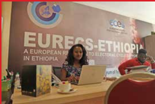
ECES Office finance department

The timely, transparent, and reliable disclosure of ECES' financial management is a cornerstone of our project implementation globally.