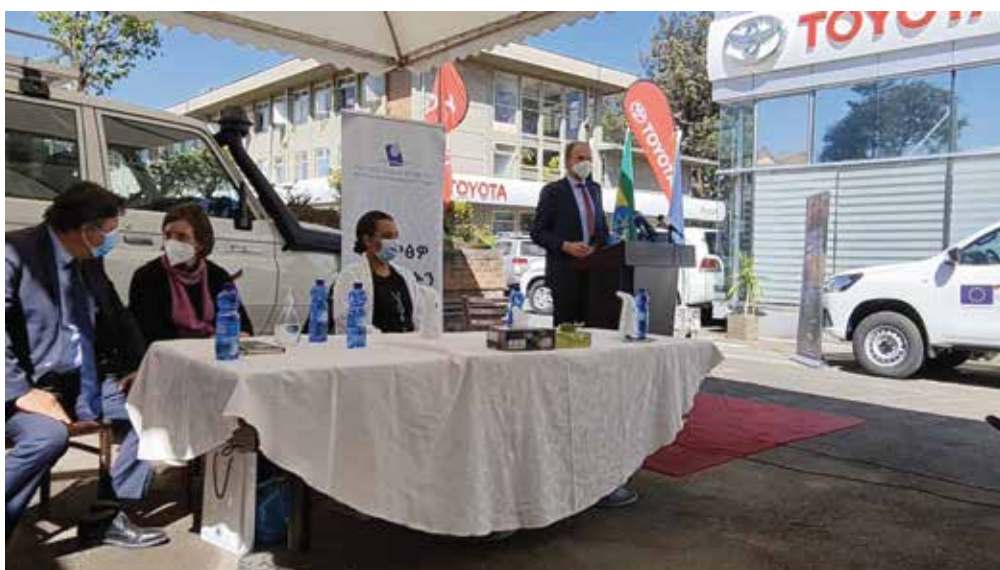
Vehicle handover ceremony for NEBE