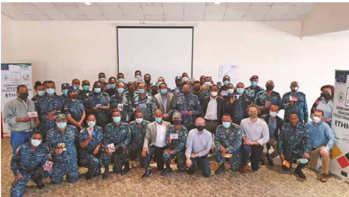
Federal police workshop, Addis Ababa

Training of Master Trainers delivered by ECES, Ethiopian Police University and NEBE to 55 Senior Police Officers.