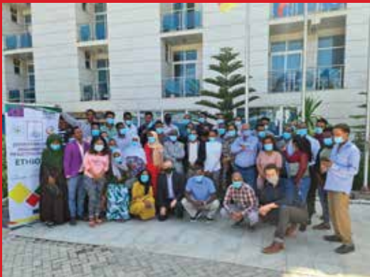
LEAD Training Participant Group Picture, Kombolcha

ECES also enrolled 86 CECOIE members to take three modules each through the PEV project. 16 CECOIE secretariat staff and CECOIE members later joined for full MEPA program. The added value of this intervention both in the election operations and in sustainably building local capacity has been highly appreciated by the participants.