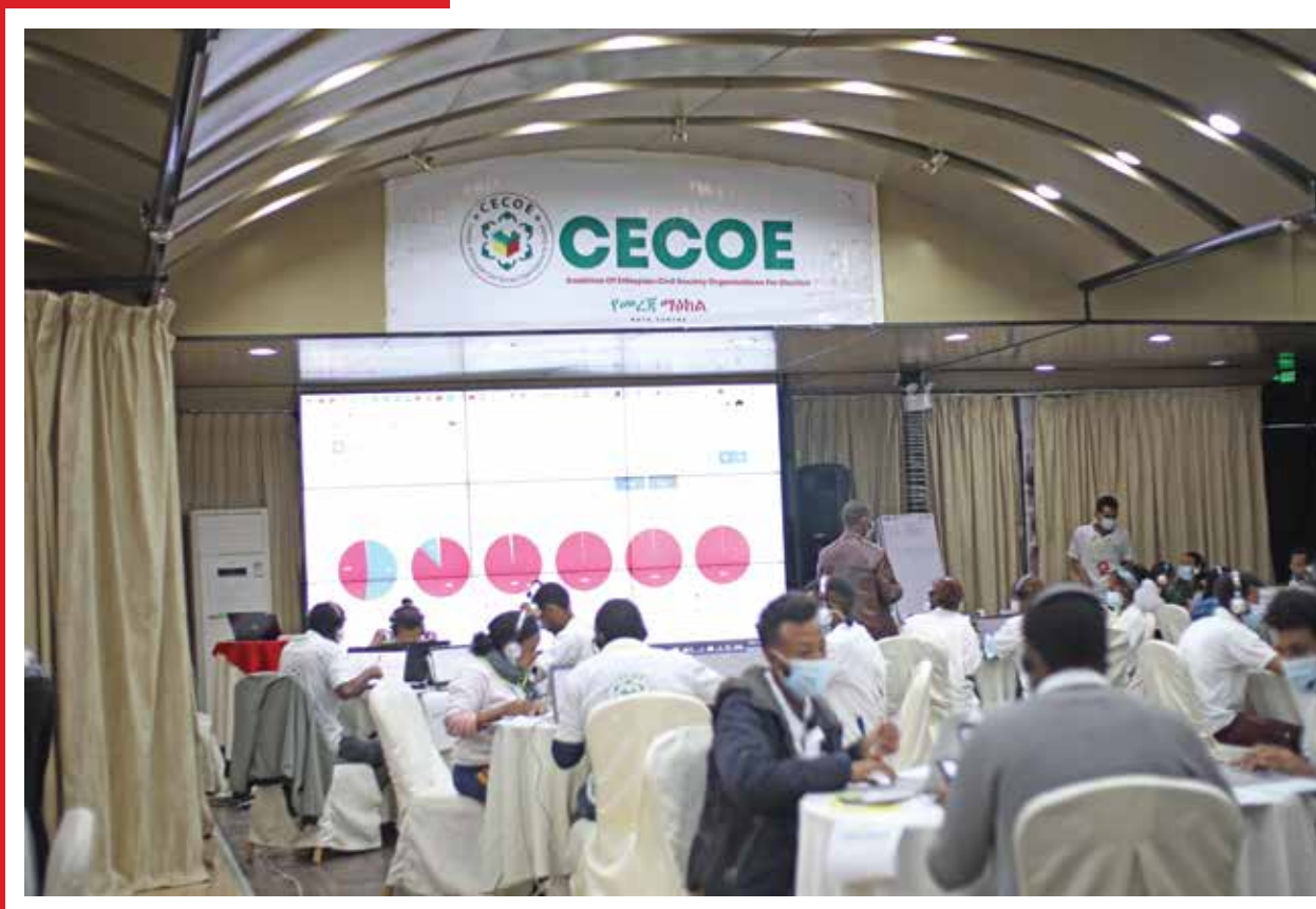
CECOE Data Center

Election report writing, international standards in election matters, candidate registration observation, and political campaign financing observation were among the trainings offered to CECOE members.