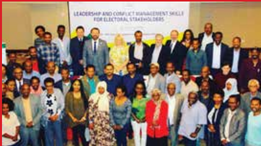
Coalition building workshop for the establishment of CECOE

200 members trained through workshops organised to capacitate the established Coalition.